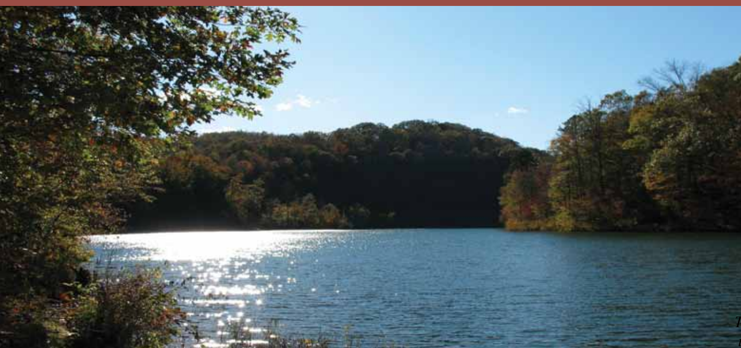
The Mud River in Lincoln County is a remote fishing and recreational area