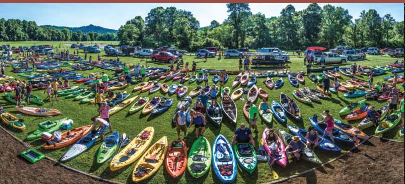
The Annual Tour De Coal is the biggest flatwater Kayaking event in the United States