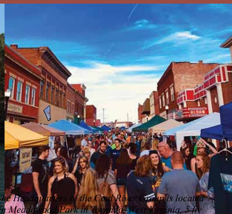
The Annual Yak fest in St. Albans