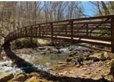
Upper Mud River Recreation Area